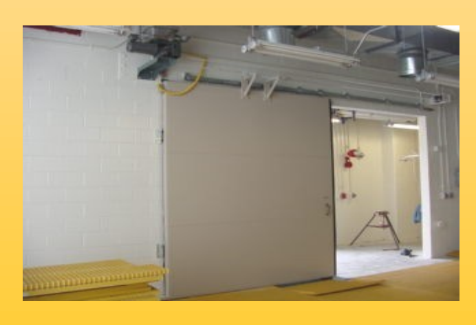
Blast and Fire Rated Sliding Door with Explosion Proof Operator for Chemical Storage