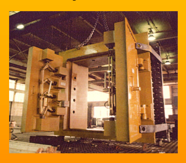
500 PSI, 5" Thick Solid Steel Blast Door Gas Tight, with Chemical Resistant Seals