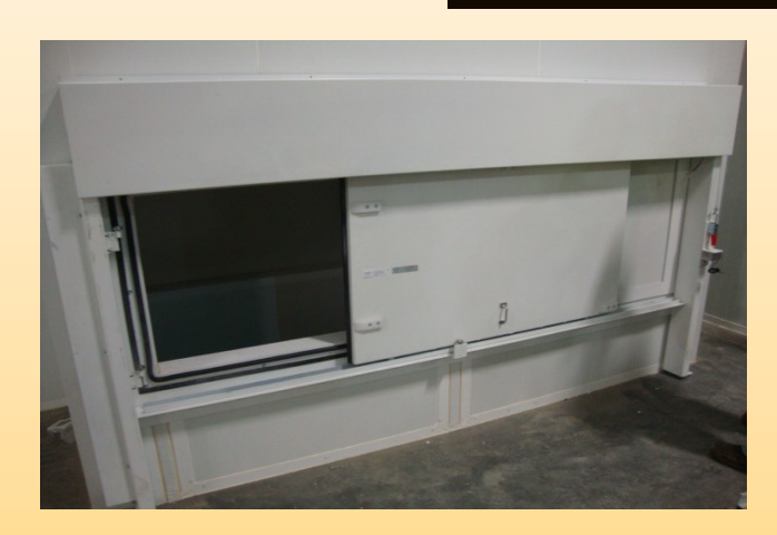
Fire Rated Sliding Pressure/Air Tight Hybrid Battery Production Facility