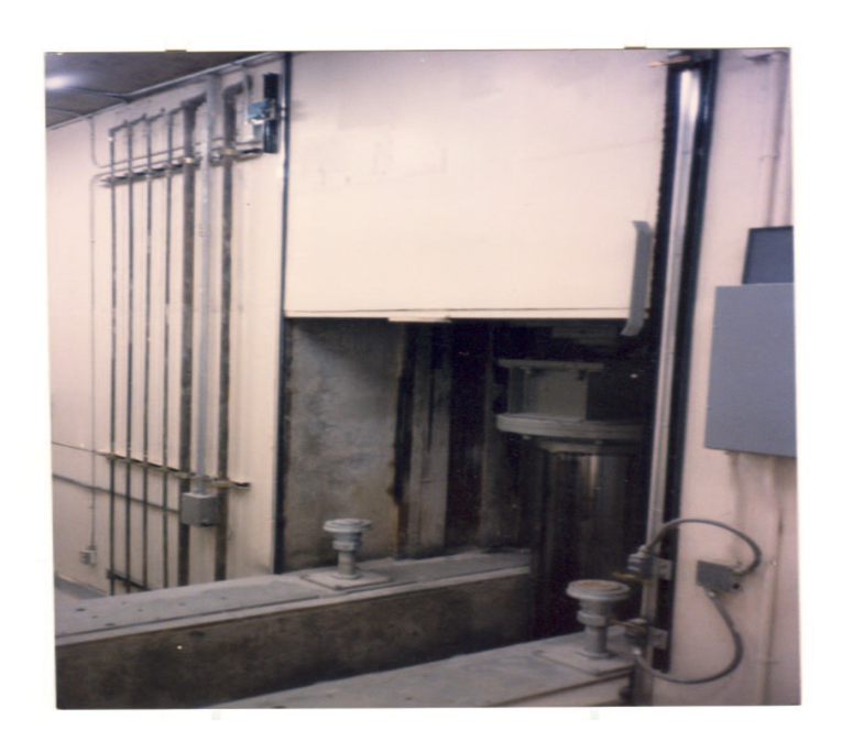
30 Ton Concrete Vertical Lifting, Hydraulically Operated, Shielding Door