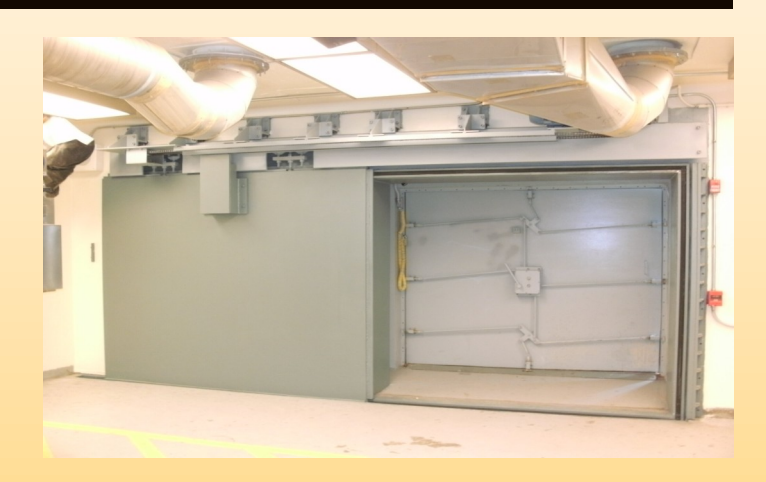
344 PSI Sliding Blast Door - Fragmentation Pneumatically Sealed- Gas Tight Under Full Gas and Shock Phase Load