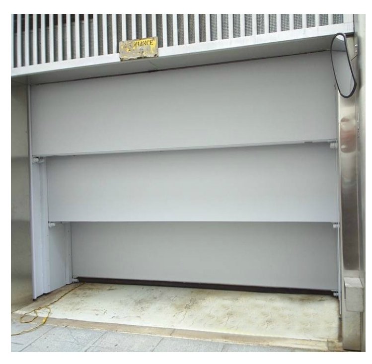
15 PSI Three Panel Vertical Lift , 50 Caliber Ballistic Resistant, K-4 Impact Rated