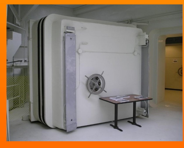
High Pressure/Vacuum Space Test Facility - Dual Pneumatic Seals and Hydraulic Operation