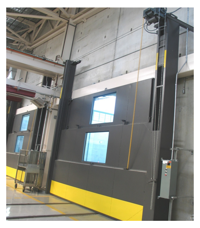
1 PSI Three Panel Vertical Lifting Fueling Door for Metro Transit System Garage