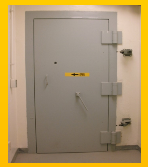
270 PSI Blast Door With Air Tight, Chemical Resistant Seals and Sight Hole