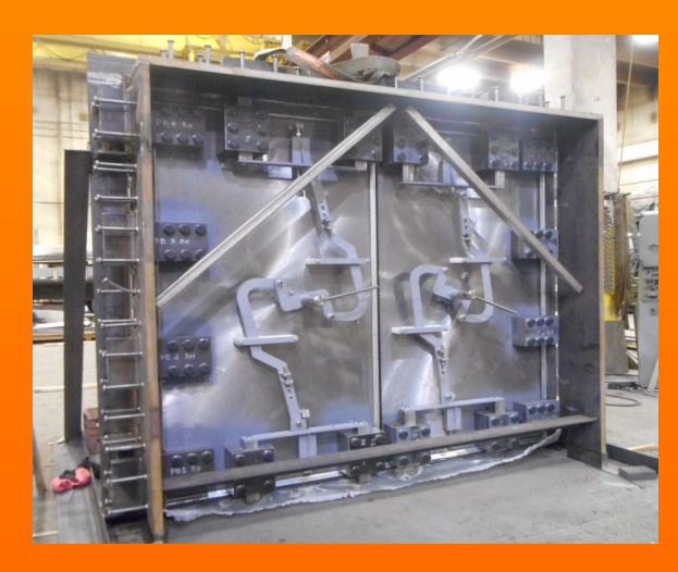
631 PSI Fragment Resistant, Air Tight, Fully Operable Post Blast Occurrence