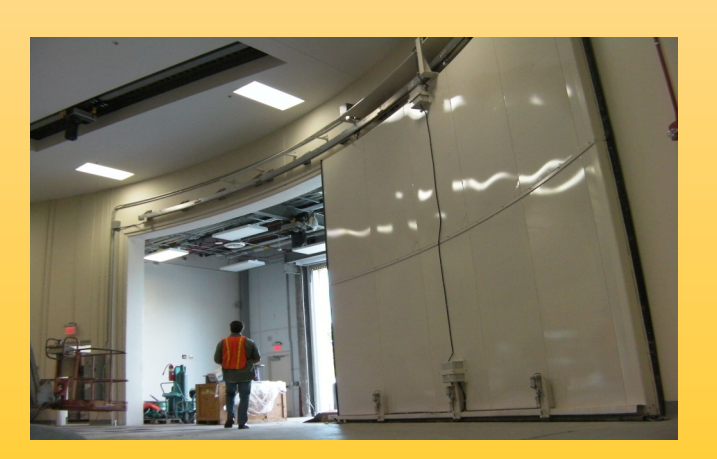
Curved Pressure Resistant Door STC 50 Acoustical rating