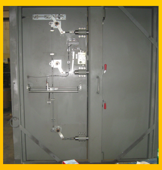
50 PSI, 3 hr Fire Rated Blast Door with Custom Panic Hardware